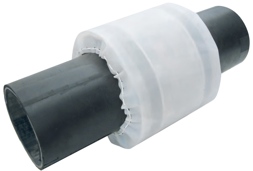
StyleTSS Teflon® Spray Shields