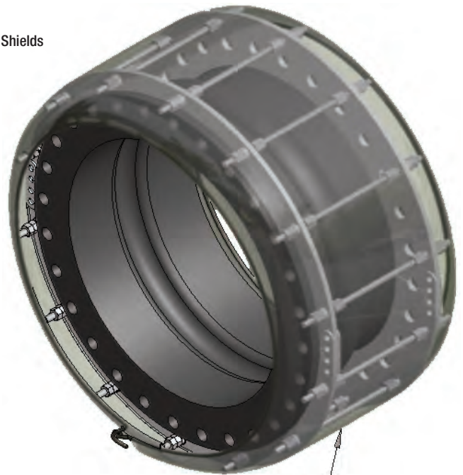
DISPLAYED AS TRANSPARENT BUT ACTUALLY TRANSLUCENT