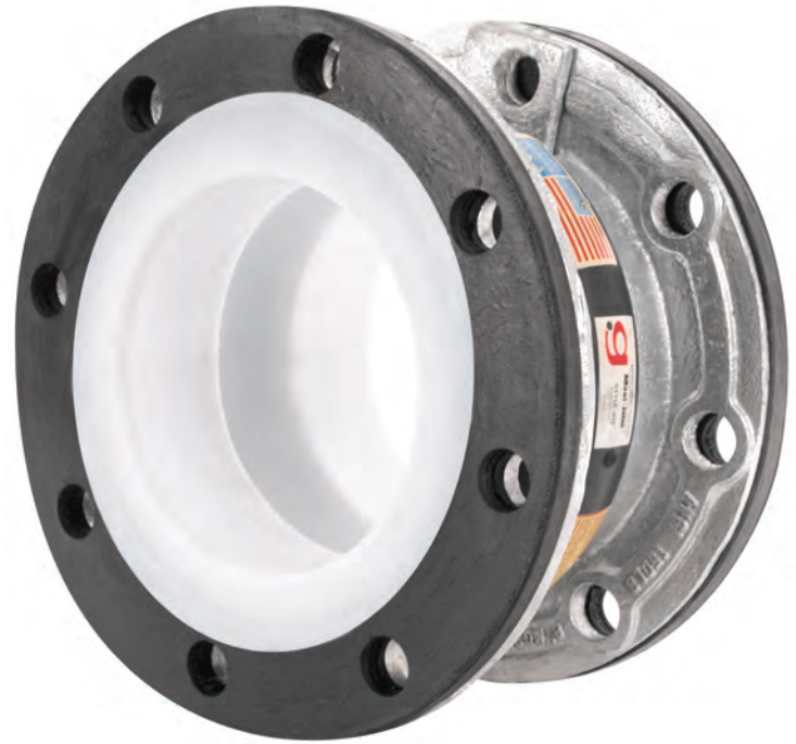
Style 1015T Teflon Lined, Expansion Joint