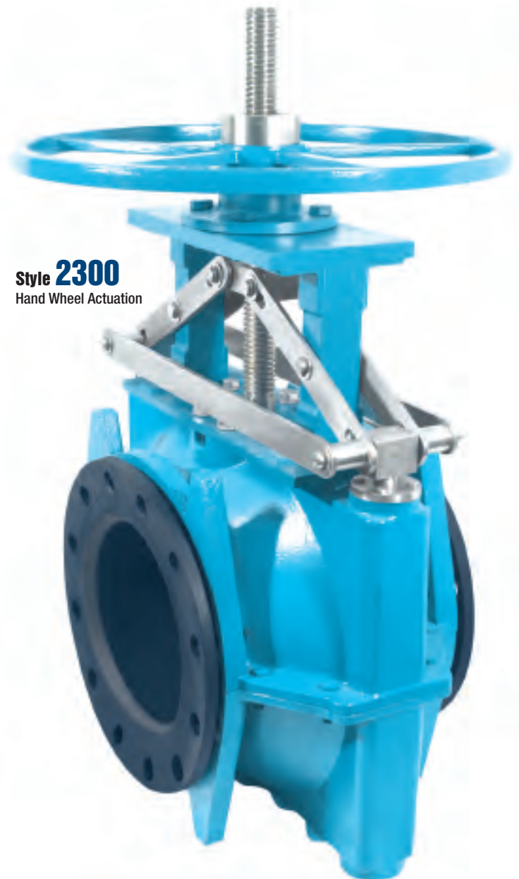
Style 2300 Hand Wheel Actuation