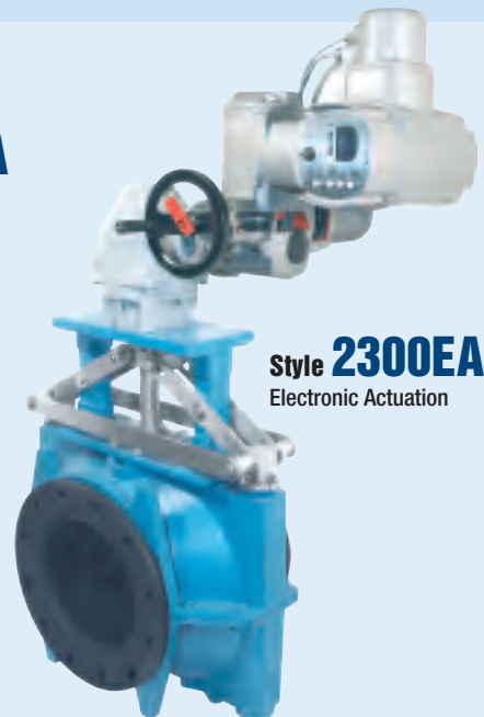
Style 2300EA Electronic Actuation