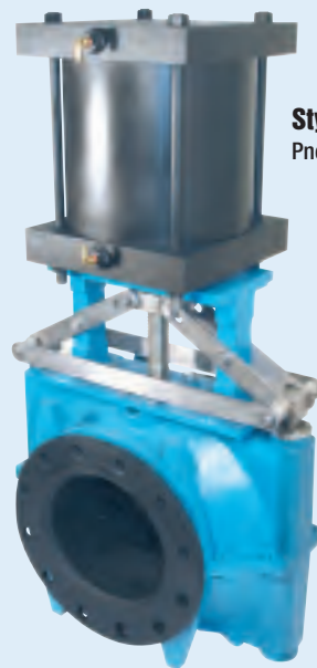
Style 2300PA Pneumatic Actuation