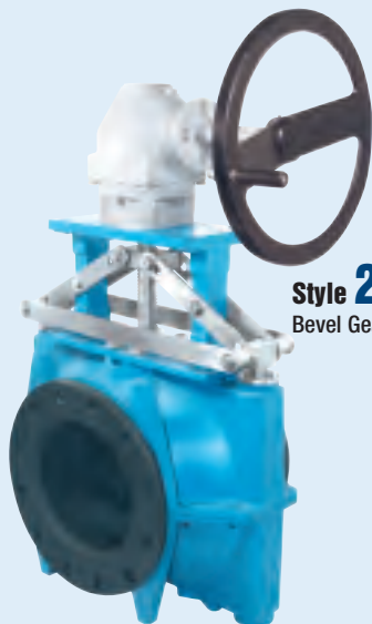
Style 2300BG Bevel Gear Actuation