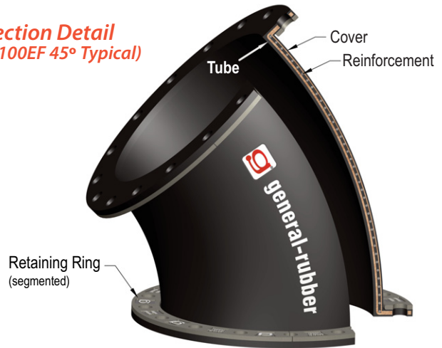
Section Detail (1100EF 45° Typical)

Sizes 1" [DN25] - 12" [DN300] | 1100EF-90°-0000-3.16